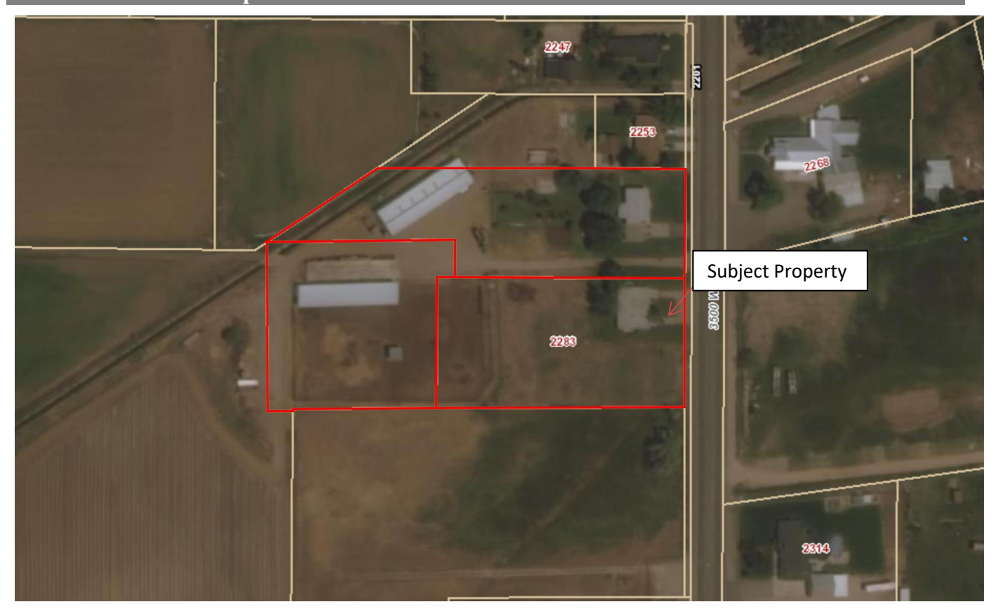
Exhibit A-Location map